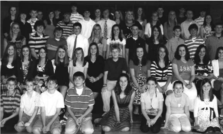
Middle school and high school students at Munsey Memorial United Methodist Church in Johnson City, Tennessee

Thank you, youth of Munsey Memorial, for being the change and inspiring us all!