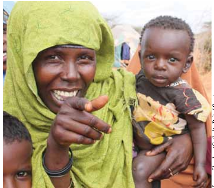
Laura Sheahen/Catholic Relief Services