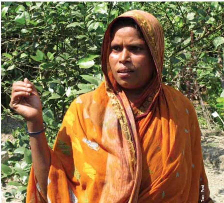
The Bangladesh Homestead Gardening program, support by USAID and Helen Keller International, combined agriculture and nutrition programming in one. The program targeted women, the primary caregivers of the malnourished children.

Child malnutrition rates in Bangladesh are among the highest in the world. A poor family's diet consists of rice and little else. When the program started, Vitamin A deficiency was causing 30,000 Bangladeshi children to go blind every year. HKI reported that children in households participating in the homestead garden program consumed significantly more nutrient-rich foods. Moreover, the households earned on average an additional $8 per month by selling their surplus, and studies showed that families used this extra income to purchase additional healthy foods not grown in the gardens, such as legumes and animal products.