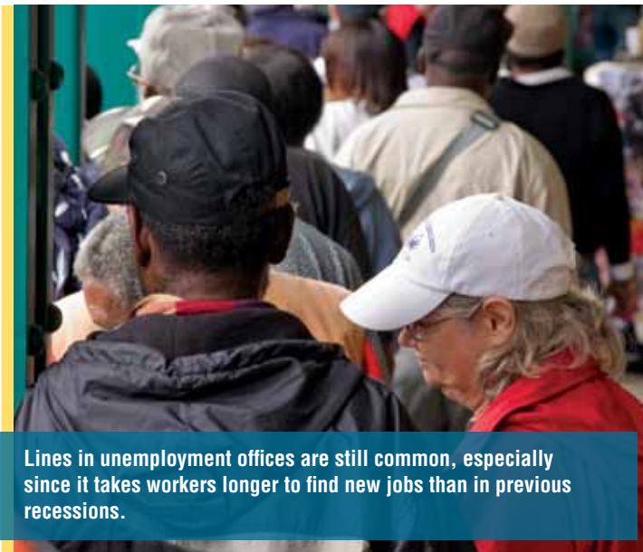
Lines in unemployment offices are still common, especially since it takes workers longer to find new jobs than in previous recessions.

Rather than do what appears to be easiest and quickest, decision makers need to consider—in thoughtful, flexible, and creative ways—significant contributors to the deficit and sizeable budget line items. There is no easy answer to the nation’s budget imbalance. But looking at all causes and weighing all response options is a more realistic solution than attempting to solve the entire problem with cuts to just a small portion of the budget.