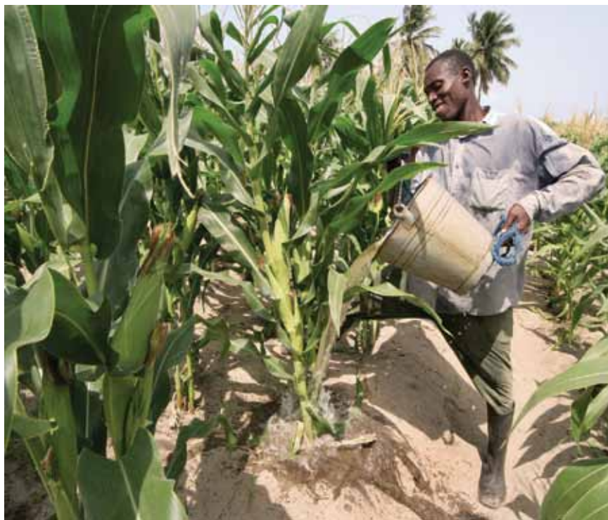
Local people like this maize farmer in Ghana are the experts on their own agricultural production challenges and what solutions will work in their communities.

The Crop Intensification Program (CIP) launched by the government of Rwanda in 2007 had a similar effect. It fo-