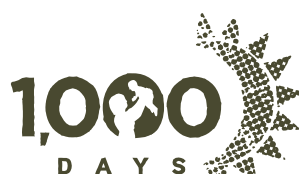
The 1,000-Day “Window of Opportunity”

The period in the life cycle from a mother’s pregnancy to a child’s second birthday is a critical window of opportunity in which nutrition-specific interventions to improve maternal and child nutrition can significantly improve children’s prospects for survival, growth, and development, especially in countries with a high burden of undernutrition. 78 Much of the child mortality in developing countries occurs in the first two years after birth. Undernutrition in these early years causes irreversible cognitive impairment, leading to poor school performance and loss of productivity. After birth, a child’s ability to meet growth standards is determined by the adequacy of dietary intake (which depends on infant and young child feeding, care practices, and food security), as well as the extent of exposure to disease. 79 A number of simple, nutrition-specific interventions are available to reduce undernutrition 80 in the critical period between pregnancy and age 2. 81