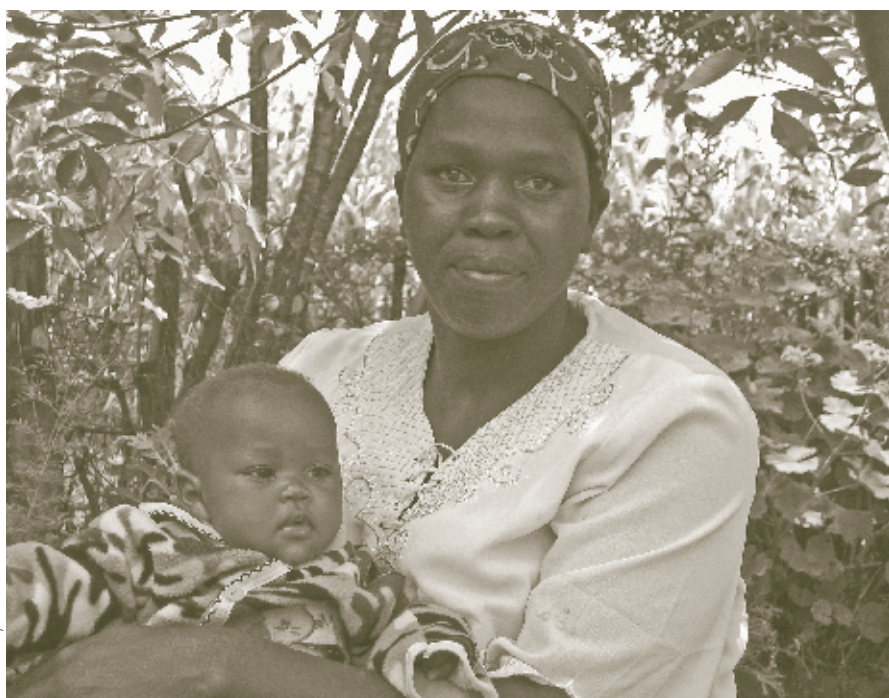
Todd Post/Bread for the World