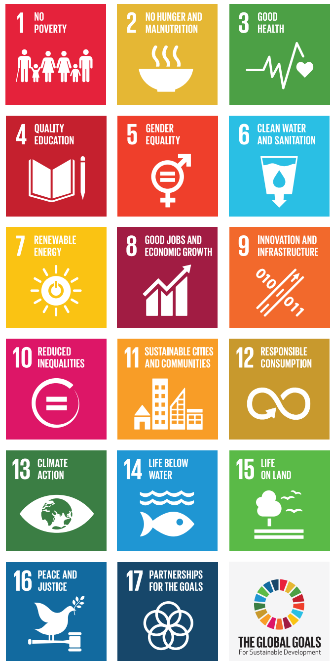
Source: Adapted from United Nations, 2015

1.9 billion adults worldwide are estimated to be overweight or obese,