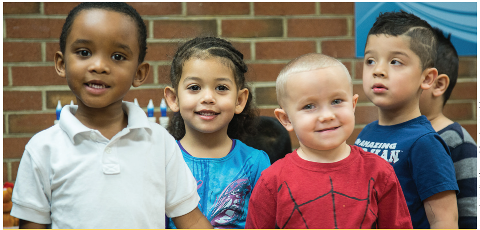
Joseph Molieri/Bread for the World

National nutrition programs allow many parents to work full days without having to worry if their children will get nutritious meals. These programs provide food while children are away from home. Free and reduced-price meals are offered