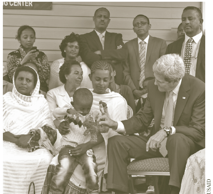
U.S. Secretary of State John Kerry plays with a young child whose family has received treatment at a PEPFAR-supported HIV clinic in Addis Ababa, Ethiopia.

In 2012, the State Department began publishing an annual fiscal transparency report that assesses countries' progress on various elements of budget and natural resource transparency. 118 The 2015 report found that only nine countries had made progress on fiscal transparency. 119 As yet, the State Department has done little to promote media coverage of its annual fiscal transparency review, or to