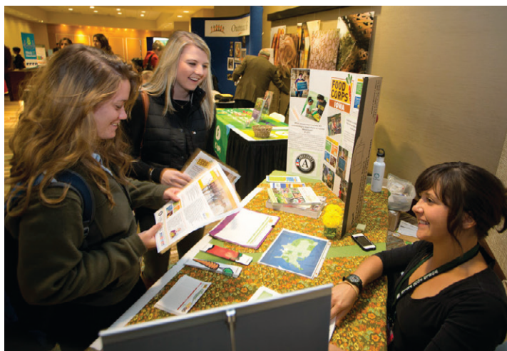
Hunger activists visit an exhibit booth at the Iowa Hunger Summit in Des Moines last month.