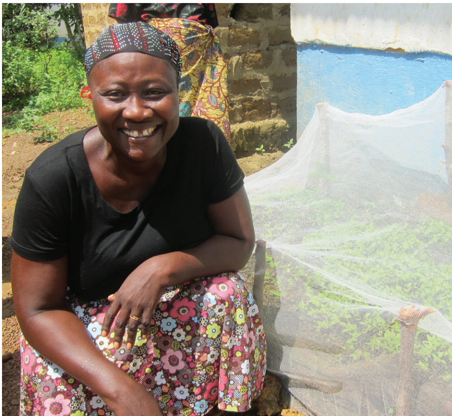
Respect shows off her newly grown peppers planted with seeds provided through USAID.

Thanks to a USAID Office of Food for Peace project