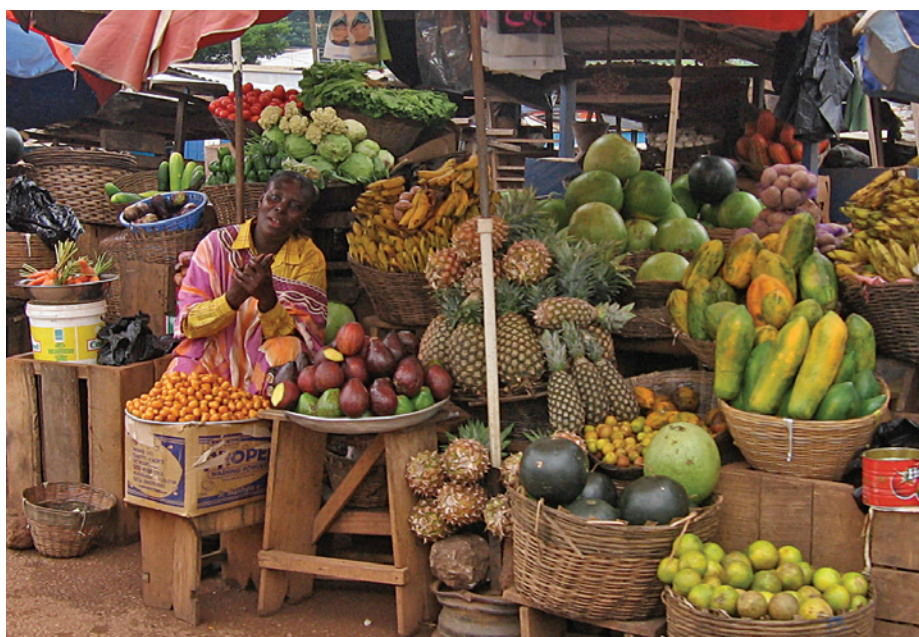
Alliance to End Hunger

Countries that have the political will to end hunger, but few resources, can benefit from support from the international community. U.S. policies and programs have contributed to progress against hunger in many countries. India and China, for example, worked with experts in agricultural science who were primarily from the United States. Foreign aid has brought thousands of scientists from Asia, Africa, and Latin America to the United States